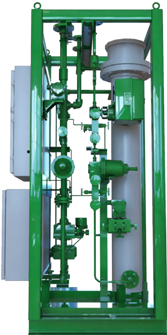
Generator Fast Degas CO 2 System (GFD)